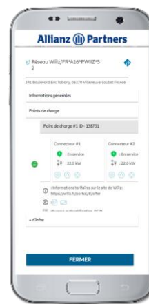
Search for charging stations

Ev-Move also helps EV drivers estimate their energy consumption and optimize their trips. These features are made possible thanks to advanced algorithms that factor in numerous parameters (weather, traffic, vehicle profile, charging station availability, etc.) that can have an impact on autonomy, recharging and driving time.